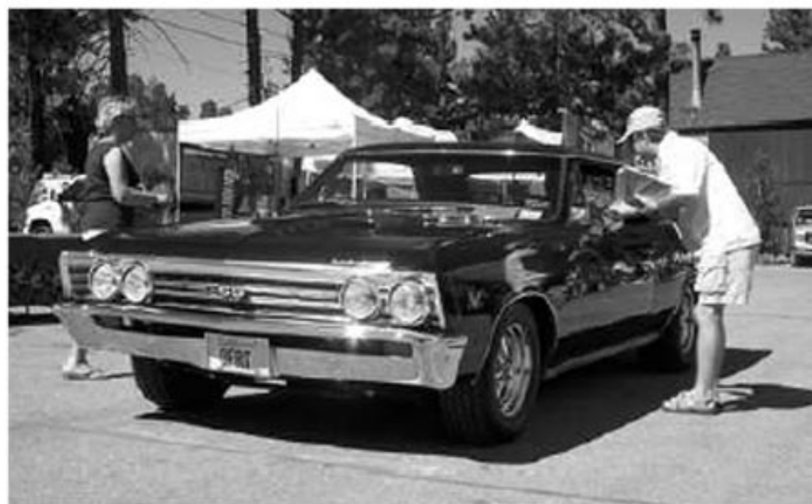
Don N. trophies at the Big Bear Fun Run

On The Road Again with Bub & Jeanne H. - Pages 1,3,5,7,9 OFFET members Ride of the Issue - Page 2 Christmas Party at the Elks- Riverside - Page 4 Deacon Guardrail - Page 6 Banish Run 2007 - Page 8 Bodoo Christmas Party - Page 10 Muller Bearings & Generator Pump Gaskets - Page 11 105 Years Ago - Page 12 OFFETX-Mas Party Pictures - Page 12 Beside The End Mill - Pages 13, 14 2nd Annual Pe-Green Evergreen Cemetery Show - Page 14 Passing Wind - Page 15 Advertisers - Please Support Calendar - Page 18 Our Lists Growing - Page 19