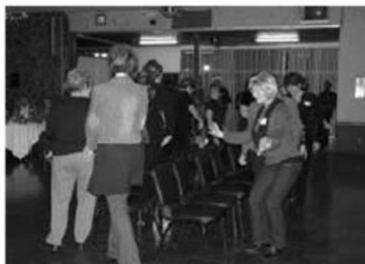
>The participants & spectators alike all enjoyed the musical chairs contest at the 2006 OFRT Christmas Party

Office (951) 683-2503 Shop (951) 682-4422 Fax (951) 683-5520