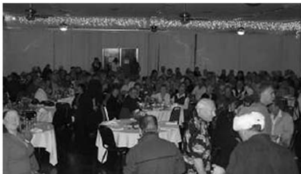
> Nearly 200 OFRT members gathered to share the Holiday cheer!

P.S. Happy New Year to All, and remember NO Route 66 –